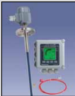
BM-30 LGX Particulate Monitor

Power Requirements: 115 VAC, 50/60 Hz ±15%, 5 VA, 230 VAC optional Output Relay: Two SPDT 10 Amp relays (warning & alarm) Ambient Temp: -25°F to +160°F (-32°C to +71°C) Process Temp: Up to 250°F (121°C) Pressure: 500 PSI Housing Enclosure: Cast aluminum, USDA approved powder coat finish Mounting: 1-1/4" NPT or 3/4" NPT 316 SS Standard: 1-1/4" NPT 316 stainless steel & sanitary flange optional Alarm: Dual alarm (alarm is 2x pre-alarm) switch selectable for instantaneous or one minute averaged Sensitivity: 1 mg/m (.0005 gr/SCF)