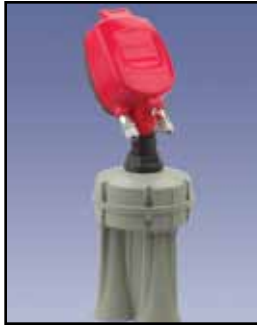
3DLevelScanner Non-Contact Sensor