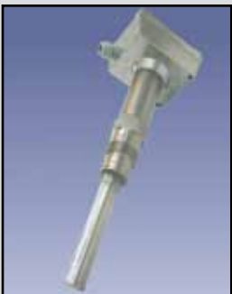
SHT-120/140 Vibrating Rod

Power Requirements: Wide range 20-250V AC/DC Power Consumption: 3 VA Relay: SPDT 5A 250 VAC Time Delay: 1 second from stop of vibration, 2 to 5 seconds for start of vibration Ambient Temp: -4°F to +150°F (-40°C to +65°C) Process Temp: To 176°F standard (80°C); to 300°F high temp (150°C) Pressure: 145 psi Wiring Cable: 1/2" Mounting: 1" NPT Enclosure: Die cast aluminum, NEMA 4, 5 & 12 Probe: 304 stainless steel, 6" insertion length Material Density: From 3.5 lb./cu. ft.