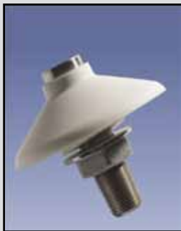
Airbrator Aeration & Vibration

Input Voltage: 115 VAC ± 10%, 50/60 Hz, 3 VA, 230 VAC ± 10%, 50/60 Hz, 3 VA, 24-48 VDC, 2 W maximum Relay: SPDT, 2 Amp 240 VAC Enclosure: NEMA 4X Operating Temp: -4°F to +158°F (-20°C to +70°C) Warranty: One year