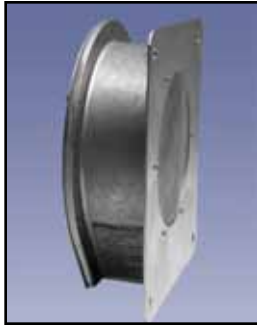
BM-45 Diaphragm Switch