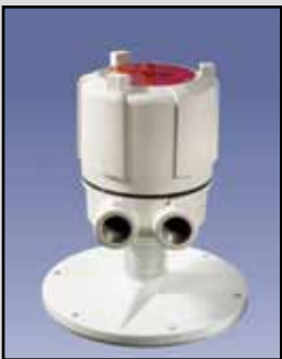
PROCAP I & II FL Capacitance Probe

PROCAP I 3-A Power Requirements: Universal power supply 24 to 240 VAC/VDC PROCAP II 3-A Power Requirements: Selectable 115/230 VAC Output Relay: DPDT 10 Amp at 250 VAC Ambient Temp: -40°F to +185°F (-40°C to +85°C) Process Temp: To 250°F Delrin probe (121°C); to 500°F Teflon probe (260°C) Pressure: 500 PSI Approvals & Certifications: Listed for Class II, Groups E, F & G Hazardous Locations Enclosure Type: NEMA 4X, 5, 9 & 12 Housing Enclosure: Die cast aluminum, USDA approved powder coat finish Mounting: 1" or 2.5" sanitary flange