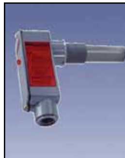
Compact PRO Capacitance Probe

Power Requirements: 115/230 VAC, 50/60 Hz \pm 15\% , 5 VA Output Relay: DPDT 10 Amp at 250 VAC Ambient Temp: -40°F to +185°F (-40°C to +85°C) Process Temp: To 250°F Delrin/bare probe (121°C); to 500°F Teflon probe (260°C) Pressure: 500 PSI Approvals & Certifications: Listed for Class II, Groups E, F & G Hazardous Locations Enclosure Type: NEMA 4X, 5, 9 & 12 Housing Enclosure: Die cast aluminum, USDA approved powder coat finish Mounting: 1-1/4" NPT or 3/4" NPT 316 stainless steel standard; 1-1/4" NPT 316 stainless steel & sanitary flange optional