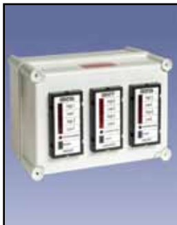
Point Level Alarm Panel

Switch Ratings: 15 Amps @125 or 250, 1/8 HP @ 125 VAC, 1/4 HP @ 250 VAC, 1/2 Amp @ 125 VDC, 1/4 Amp @ 250 VDC Operating Temp: -40°F to +300°F (-40°C to +149°C) Approvals & Certifications: Listed for Class II, Groups E, F & G Hazardous Locations Enclosure Type: NEMA 4, 5, 9 & 12 Housing Enclosure: Die cast aluminum Mounting: Internal or external, 16 gauge galvanized mounting plate