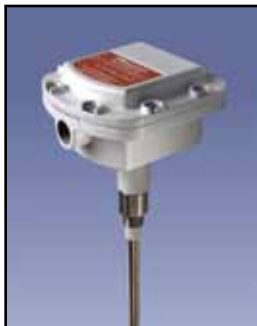
Dust Detect 1000 Dust Detection

Power Requirement: 115 or 230 VAC 50/60 Hz, 5 VA Operating Temp Remote: -22°F to +158°F (-30°C to +70°C) Operating Temp Console: -31°F to +158°F (-35°C to +70°C) Process Temp: 250°F (121°C) if ambient air temperature is below 150°F (65°C) Detection Range: Up to 10 feet Frequency: 24.125 GHz, less than 1mW/cm 2 (OSHA limit is 10mW/cm 2 ) Remote Enclosure: Die cast aluminum Remote Approvals: Listed for Class II, Groups E, F & G Hazardous Locations Enclosure Type: NEMA 4X, 5, 9 & 12 Output: DPDT dry contacts, 5A @ 240 VAC, or 30 VDC Time Delay: Single turn 0.1-15 sec