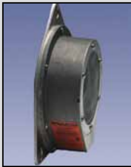
BM-65 Diaphragm Switch

Switch Ratings: 15 Amps @125, 250 or 480 VAC, 1/8 HP @ 125 VAC, 1/4 HP @ 250 VAC, 1/2 Amp @ 125 VDC, 1/4 Amp @ 250 VDC Operating Temp: -40°F to +300°F (-40°C to +149°C) Housing Enclosure: Die cast aluminum Mounting: Internal or external, 16 gauge galvanized mounting plate