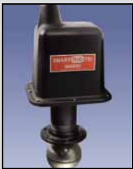
SmartBob-TS1 Cable-Based Sensor

Power Requirements: 115/230 VAC 50/60 Hz Ambient Temp: -40°F to +185°F (-40°C to +85°C) Process Temp: Up to 500°F (260°C) Measurement Range: Up to 180' Measurement Rate: 2 feet per second Accuracy: ± 0.25% distance measurement accuracy Mounting: 3"- 8" NPT Enclosure: Molded polycarbonate Approvals & Certifications: Listed for Class II, Groups E, F, & G Hazardous Locations Enclosure Type: NEMA 4X, 5, 9 & 12