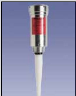
SmartWave Pulse Radar Transmitter

Power Requirements: AC units 115 VAC 60 Hz or 230 VAC 50 Hz; DC units 12 to 30 VDC 0.07 Amps Ambient Temp: -40°F to +140°F (-40°C to +60°C) Process Temp: Up to 200°F (93°C) Operation: Ultrasonic Frequency: 25 to 148 KHz Measurement Range Liquids: 90' maximum Measurement Range Solids: 90' maximum Accuracy: ± 0.25% Beam Angle: 6° - 12° conical at -3dB Temp Compensation: Continuous in transducer Output: 4-20 mA and RS-485 Mounting: 3" NPT Enclosure: PVC-94VO Approvals & Certifications: NEMA 4X (IP65)