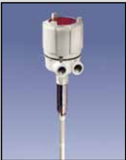
PROCAP IX & IIX Capacitance Probe

PROCAP I Power Requirements: Universal power supply 24 to 240 VAC/VDC PROCAP II Power Requirements: Selectable 115/230 VAC Output Relay: DPDT 10 Amp at 250 VAC Ambient Temp: -40°F to +185°F (-40°C to +85°C) Process Temp: To 250°F Delrin/Bare probe (121°C); to 500°F Teflon probe (260°C) Pressure: 500 PSI Approvals & Certifications: Listed for Class II, Groups E, F & G Hazardous Locations Enclosure Type: NEMA 4X, 5, 9 & 12 Housing Enclosure: Die cast aluminum, USDA approved powder coat finish Mounting: 1-1/4" NPT or 3/4" NPT 316 SS standard; 1-1/4" NPT 316 SS & sanitary flange optional