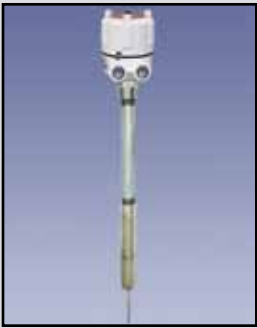
VR-41 Vibrating Rod

Power Requirements: Wide range 20-250V AC/DC Relay: SPDT relay, 5A @ 250 VAC (optional DPDT relay available) Time Delay: 1 second from stop of vibration, 2 to 5 seconds for start of vibration Ambient Temp: -4°F to +140°F (-20°C to +60°C) Process Temp: To 176°F standard (80°C); to 284°F high temp (140°C) Pressure: 145 psi Enclosure: Die cast aluminum, NEMA 4, 5 & 12 Probe: 304 stainless steel, 7.37" insertion length Mounting: 1-1/2" NPT Material Densities: From 1.25 lb./cu. ft.