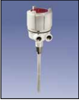
PROCAP I & II Capacitance Probe