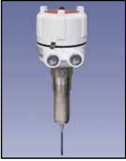
VR-21 Vibrating Rod