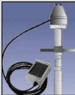
PRO HTRC-20 Capacitance Probe

Power Requirements: 115, 230 VAC or 24 VDC Output Relay: SPDT 5 amp at 250 VAC Ambient Temp: -40°F to +185°F (-40°C to +85°C) Process Temp: To 240°F (116°C) Pressure: 150 PSI Approvals & Certifications: NEMA 4X, 5 & 12 Enclosure: PVC Probe: CPVC Mounting: 1" NPS (1-1/4" adapter available) LED: Indicates material presence or absence