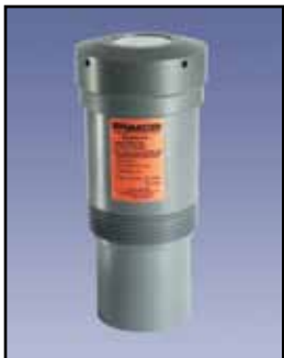
SmartSonic Ultrasonic Transmitter

Power Requirements: 115/230 VAC 50/60 Hz Ambient Temp: -20°F to +140°F (-29°C to +60°C) Process Temp: Up to 140°F (60°C) Measurement Range: 60 feet Measurement Rate: 1 foot per second Accuracy: ± 0.25% distance measurement accuracy Mounting: Special bolt on or 3"- 6" NPT Enclosure: Rotational molded polyethylene Approvals & Certifications: NEMA 4X (IP65)