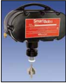
SmartBob2 Cable-Based Sensor