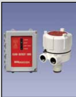
Flow Detect 1000 Microwave Flow Detection

Preferred Applications: Powders and solids Measuring Range: 200 feet (61 meters) Supply Voltage: 20 - 32 VDC Process Temp: -40°F to 185°F (-40°C to 85°C) Process Pressure: -0.2 - 1bar (-2.9 to 14.5 psi) Signal Output: 4-wire 4-20mA/HART/RS-485/Modbus Emitting Frequency: 3 KHz to 10 KHz Housing: Aluminum die cast powder coated Approval: ATEX II 1/2D, 2D, Ex ibD/iaD 20/21 T110°C, ATEX II 2G Ex ia/ib IIB T4, FM Intrinsically Safe Class I, II, Division I, Groups C, D, E, F, G