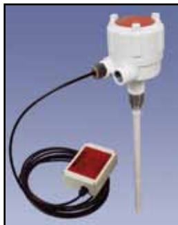
PRO REMOTE Capacitance Probe