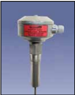
CVR-600 Vibrating Rod

Power Requirements: Wide range 20-250V AC/DC Relay: SPDT relay, 5A @ 250 VAC (optional DPDT relay available) Time Delay: 1 second from stop of vibration, 2 to 5 seconds for start of vibration Ambient Temp: -4°F to +140°F (-20°C to +60°C) Process Temp: To 176°F standard (80°C); to 284°F high temp (140°C) Pressure: 145 psi Enclosure: Die cast aluminum, NEMA 4, 5 & 12 Probe: 304 stainless steel, 13" to 13' insertion length Mounting: 1-1/2" NPT Material Densities: From 1.25 lb./cu. ft.