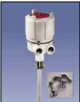
PROCAP I & II 3-A Capacitance Probe

PROCAP IX Power Requirements: Universal power supply 24 to 240 VAC/VDC PROCAP IIX Power Requirements: Selectable 115/230 VAC Output Relay: DPDT 10 Amp at 250 VAC Ambient Temp: -40°F to +185°F (-40°C to +85°C) Process Temp: To 250°F Delrin probe (121°C); to 500°F Teflon probe (260°C) Pressure: 500 PSI Approvals & Certifications: Listed for Class I, Groups C & D and Class II, Groups E, F & G Hazardous Locations Enclosure Type: NEMA 4X, 5, 7, 9 & 12 Housing Enclosure: Die cast aluminum, USDA approved powder coat finish Mounting: 1-1/4" NPT or 3/4" NPT 316 SS standard; 1-1/4" NPT 316 SS & sanitary flange optional