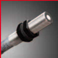
Sensor technology – Compact intelligence