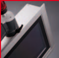
Enclosure technology – Function and design