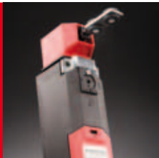
Switch technology – Economy meets safety