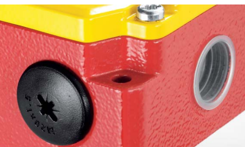
Easy to use: Cable entrances...