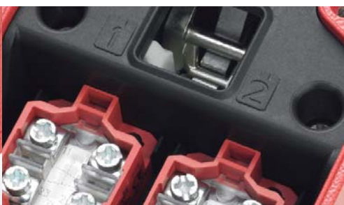
... and large connection area