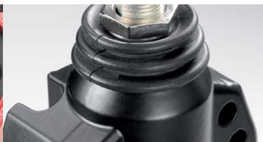
Optimum protection: the outer sleeve